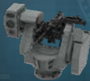
ADDER RWS LITE