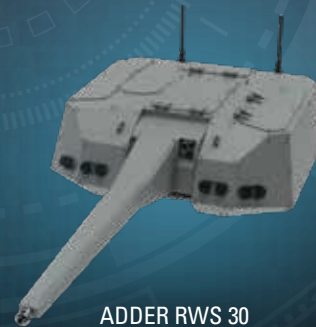
ADDER RWS 30