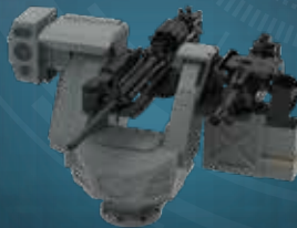
ADDER RWS TWIN